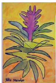
Julio Mendez Age: 10

ArtAbilities offers an assortment of high quality blank note cards featuring four of our favorite artists. The assortment includes two each of four designs (6.25 x 4.6") and 8 white envelopes. $20.00