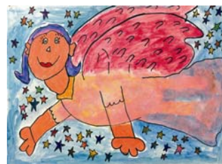
Ghissel Fajo Age: 7