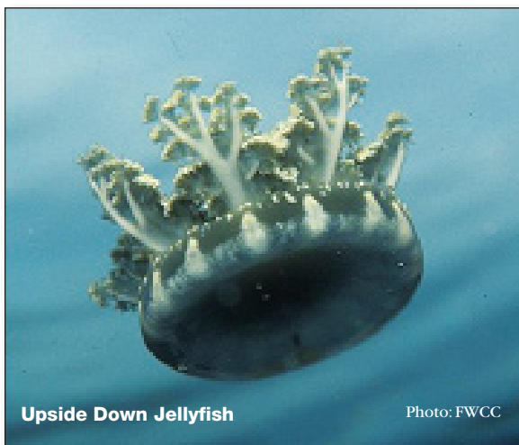
Upside Down Jellyfish